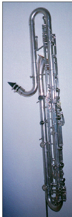
Contra Bass Clarinet 'Paperclip'

For more information about Clarinet Fusion or booking, please contact us.