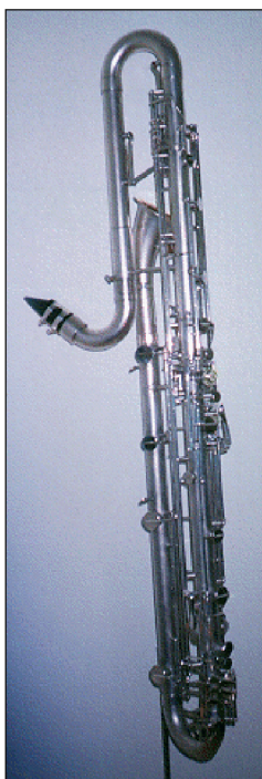
Contra Bass Clarinet 'Paperclip'

For more information about Clarinet Fusion or booking, please contact us.