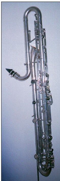
Contra Bass Clarinet 'Paperclip'

For more information about Clarinet Fusion or booking, please contact us.