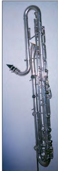
Contra Bass Clarinet 'Paperclip'

"I look at my clarinet sometimes and I think, I wonder what's going to come out of there tonight? You never know."