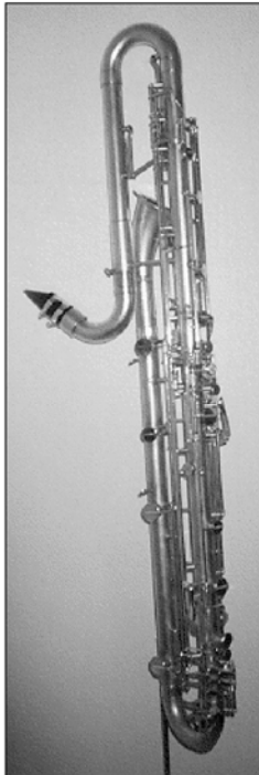
Contra Bass Clarinet 'Paperclip'

Oh! If only we had clarinets? You have no idea of the effect of clarinets!