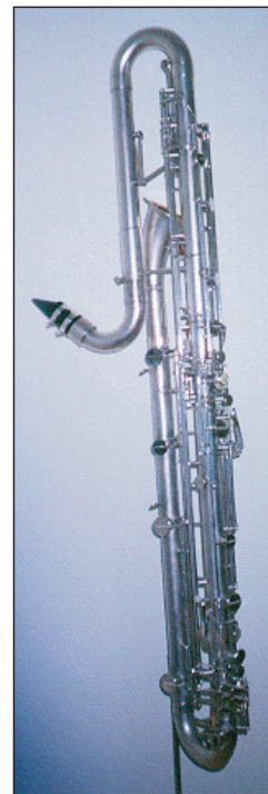
Contra Bass Clarinet ‘Paperclip’

The BBb Contra Bass Clarinet is the largest of all clarinets in regular use - about 9 feet in length - and not very common. Composers usually only use this instrument for special effects. It’s extremely deep tone is comparable to that of a string bass, and it often plays that part in orchestral transcriptions. It is one octave lower than the bass clarinet, 2 octaves lower than the “regular” clarinet, and almost 3 octaves lower than the Ab piccolo clarinet. Both the E Eb contra alto and BBb contra bass clarinets are built in two configurations: a ‘straight’ clarinet style, looking much like a longer version of the bass clarinet (made of wood and metal; or all metal); and an all metal version known as a “paperclip” due to its folded shape. Two even-larger types of clarinets were built on an experimental basis by the G. Leblanc Corporation: E E E Eb Octocontra Alto — An octave below the contra alto clarinet, and the B B B b Octocontra Bass — An octave below the contra bass clarinet. Only three E E E Eb and one B B B b instruments were ever built.