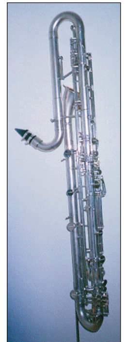
Contra Bass Clarinet 'Paperclip'

For more information about Clarinet Fusion or booking, please contact us.