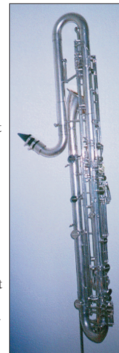
Contra Bass Clarinet ‘Paperclip’

Two even-larger types of clarinets have been built on an experimental basis by the G. Leblanc Corporation: EEEb Octocontra Alto — An octave below the contra alto clarinet. Only three have been built; and the BBBb Octocontra Bass — An octave below the contra bass clarinet. Only one was ever built.