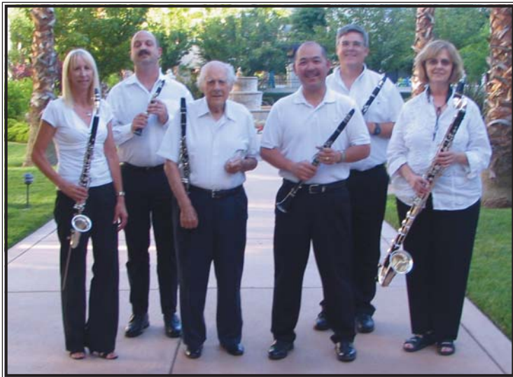
• Clarinet Fusion •